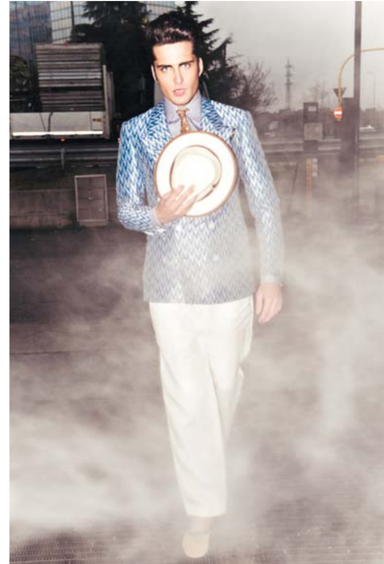
outfit GIANFRANCO FERRE hat STETSON