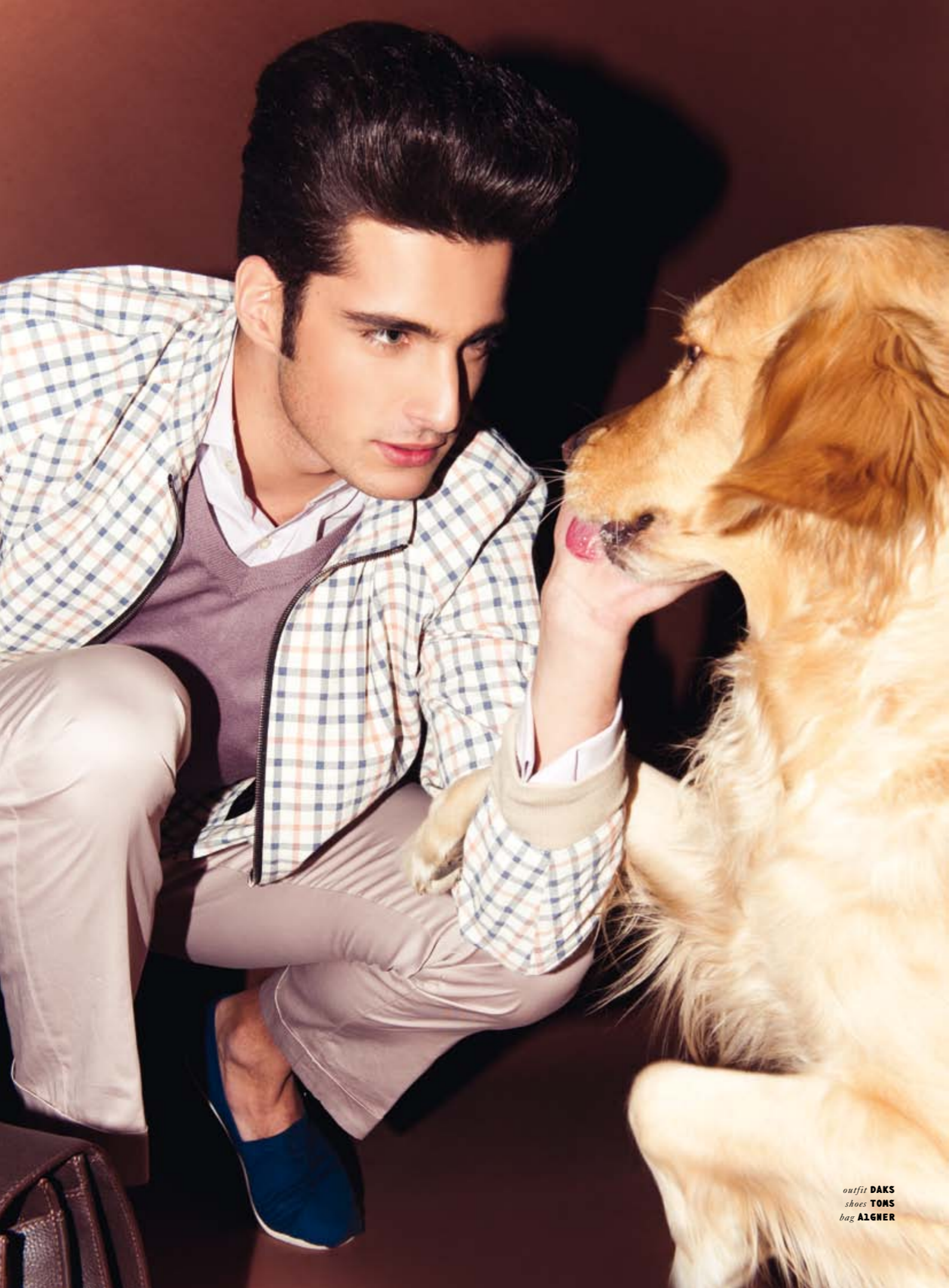
outfit DAKS shoes TOMS bag ALGER