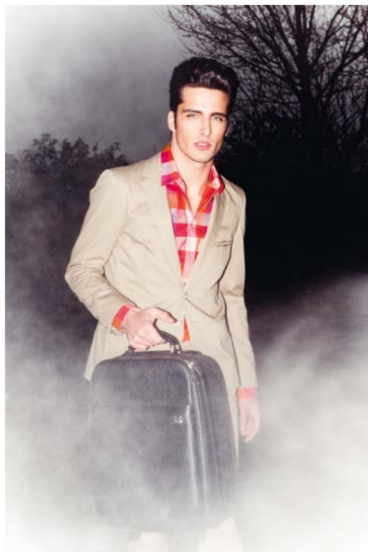
suit HUGO shirt SAND suitcase ALGER