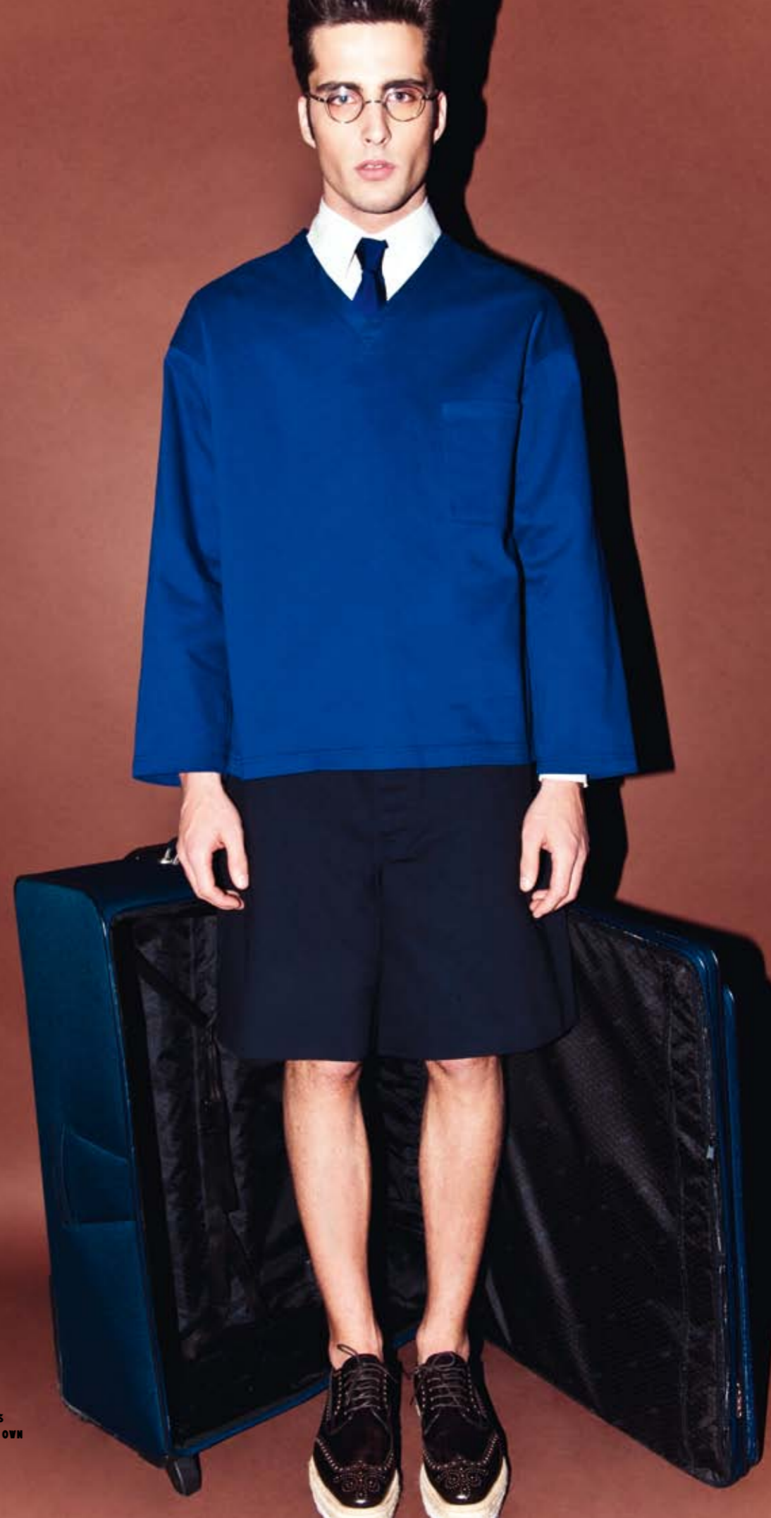
outfit PRADA glasses FREUDENHAUS suitcase STYLIST'S OWN